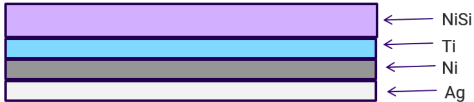
Figure 2: 100mm wafer back metal with Ag

Along with this change the product will move from 100mm diameter wafers to 150mm wafers. All 150mm wafers are shipped with gold (Au) back metal as shown in Figure 3. The change to gold (Au) back metal improves the ability to withstand harsh environments, such as high humidity. The new back metal is also compatible with new sintering die attach methods. There is no change to the published datasheet specifications and no change to the package or published part numbers.